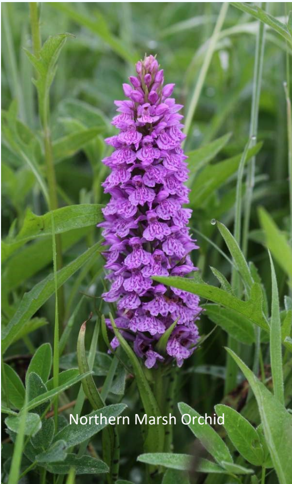
Northern Marsh Orchid

On a recent inspection, species such as Northern Marsh Orchid were present but the main species is Meadowsweet which is becoming quite rampant throughout the area.