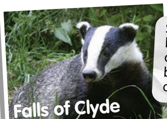
Falls of Clyde

See badgers, kingfishers, bats and dippers at Falls of Clyde! Take a guided badger walk or embark on a nature trail.