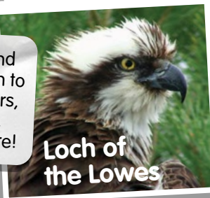
Loch of the Lowes

Lowes has fantastic hides and viewing windows from which to spot wildlife – look for beavers, ospreys, otters, red squirrels, woodpeckers and much more!