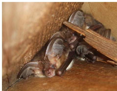
Roosting bats

Thanks, as always, go to the speakers and my fellow committee members for delivering a very successful programme of talks.