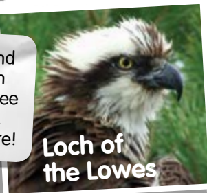
Loch of the Lowes

Lowes has fantastic hides and viewing windows from which to spot wildlife – you might see ospreys, otters, red squirrels, woodpeckers and much more!