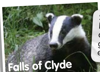
Falls of Clyde

See badgers, kingfishers, bats and peregrine falcons at Falls of Clyde! Take a guided badger walk or embark on a nature trail.