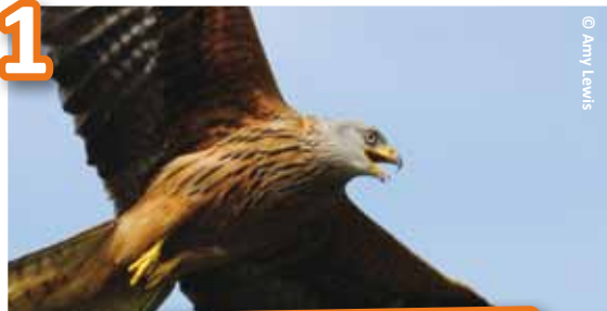
Red kite reintroduction

Once extinct in Scotland, the red kite was reintroduced to the Black Isle some 20 years ago. Join Duncan Orr-Ewing for a progress report. See page 12.